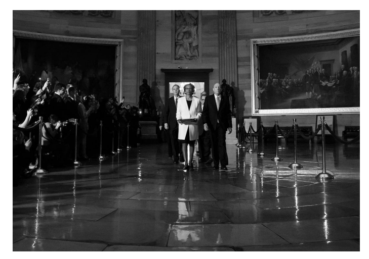
The Articles of Impeachment being walked from the House to the Senate in the United States Capitol. House Judiciary Democrats (@housejuddems), 1/16/20

How and in what order do accountability subtypes and their aspects develop? What roles do different types of constraint on the government play in the maintenance of democratic peace? Two recent, related articles answer these questions using V-Dem data. The first study (Mechkova et al. 2019) attempts to map the order in which accountability subtypes and their specific aspects develop. It finds that high levels of vertical accountability are observed before high levels of other forms of de-facto accountability. The second study (Hegre et al. 2019) investigates the presence and strength of the three subtypes and the continuation of democratic peace between states. Contrary to prior studies, the authors find that vertical accountability is less effective at preventing inter-state wars than either horizontal or diagonal accountability.