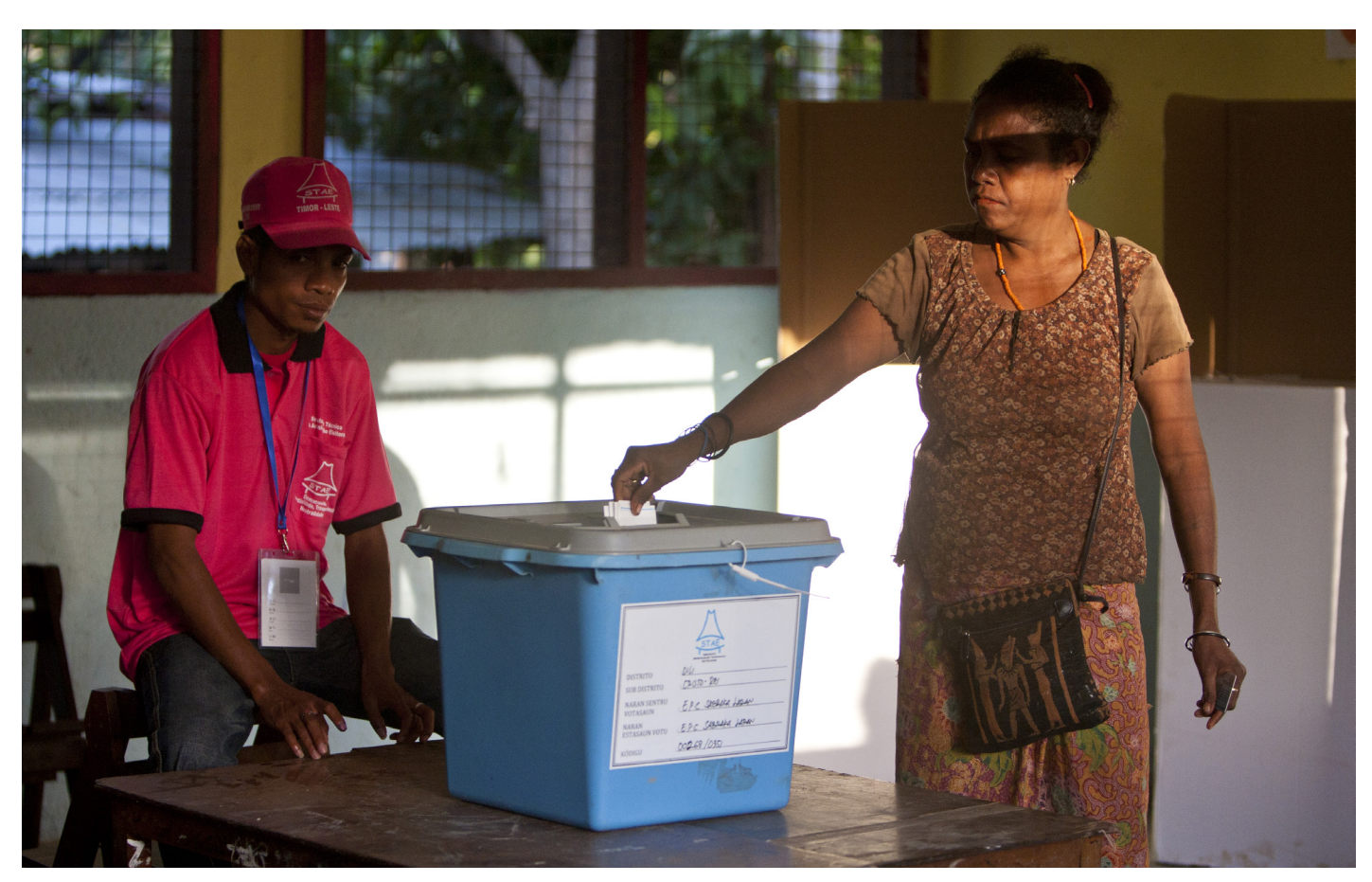
A voter casts her ballot in Timor-Leste's parliamentary elections.